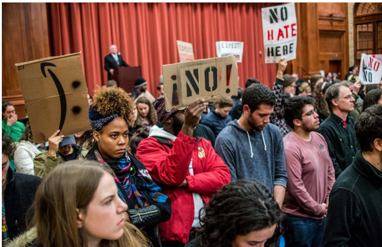
Charles Murray's visit in March 2017 provokes uproar at Middlebury College