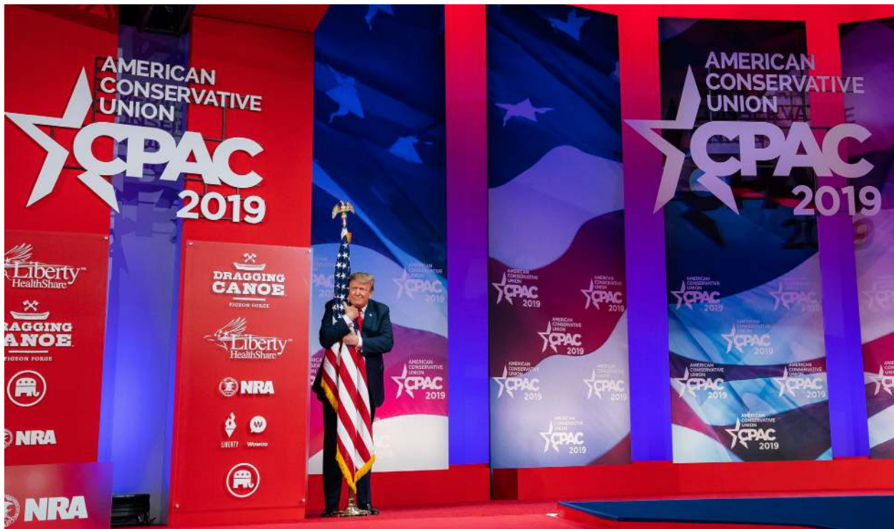
President Donald J. Trump is introduced on stage at the Conservative Political Action Conference (CPAC), March 2, 2019, at the Gaylord National Resort and Convention Center in Oxon Hill, Md

who “advance leftist propaganda in the classroom.” 652 And rather than emphasize rights to free speech for all, or touch on the ways that some conservative media outlets have worked to intimidate left-leaning faculty, Sessions struck a highly partisan tone, suggesting that controversies on campus had targeted, and silenced, only conservative voices. 653