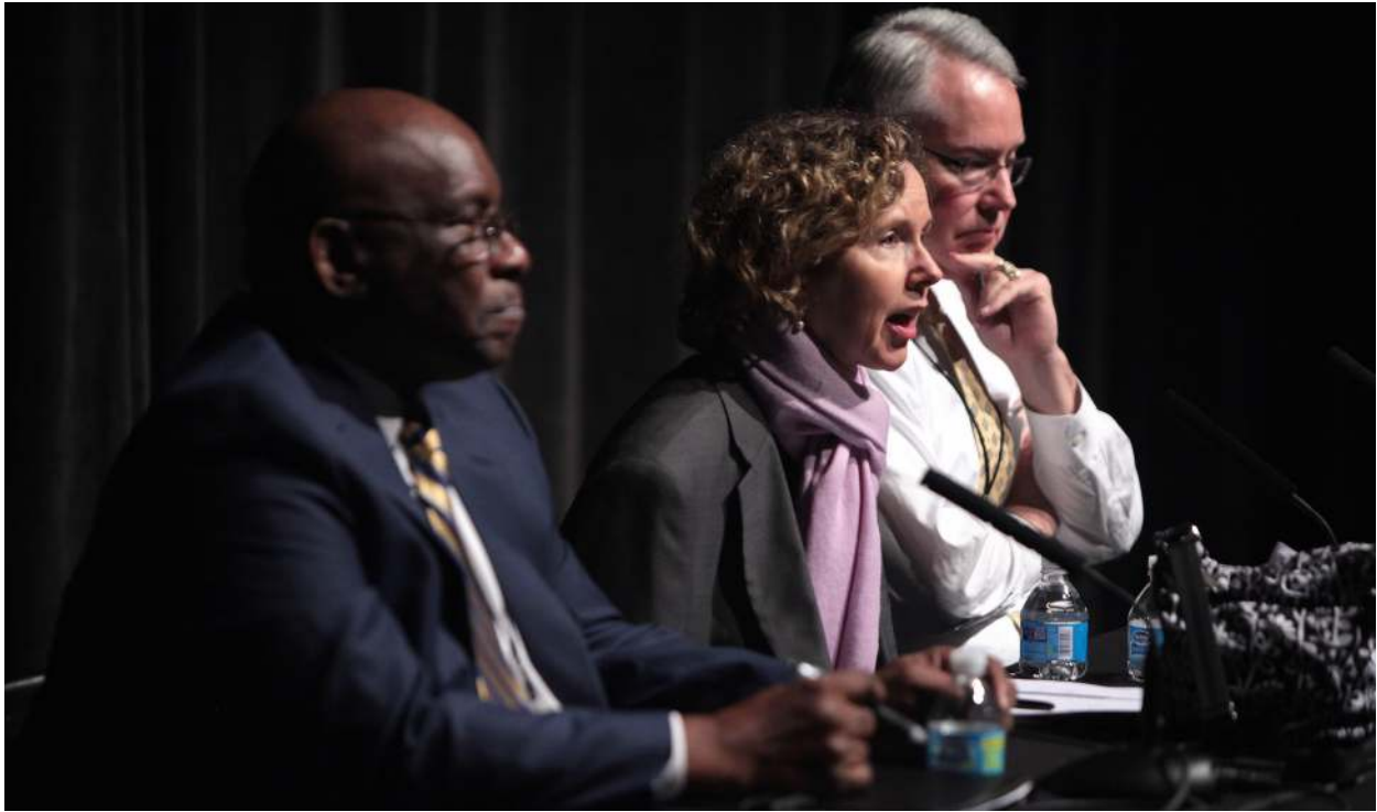
Heather Mac Donald takes part in Center for Political Thought & Leadership panel at Arizona State University in 2015