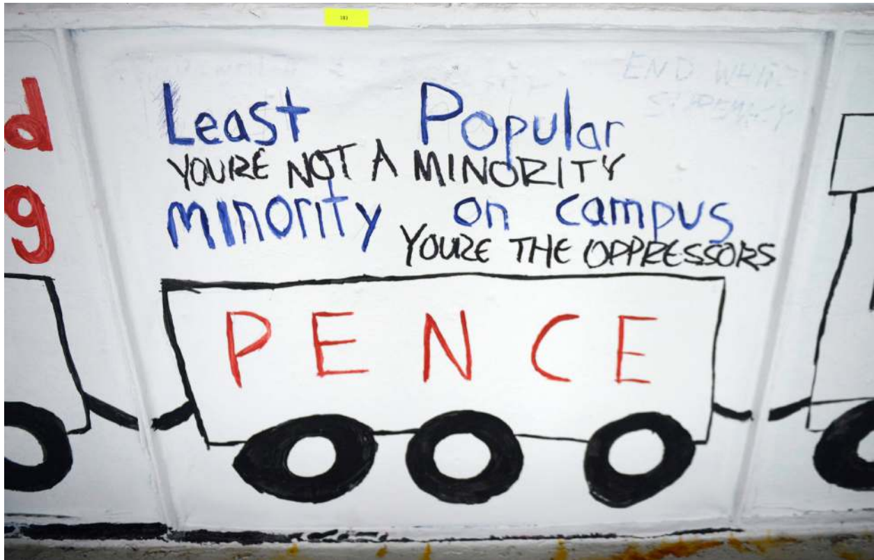
The University's College Republicans painted a pro-Trump mural during Paint the Bridge on the Washington Avenue Bridge that was later vandalized in October 2017

are hostile to the free exchange of ideas is slipping into mainstream opinion.” 39 These assessments of the climate for speech on campus remain contested, and there has been much nuanced analysis and debate. 40