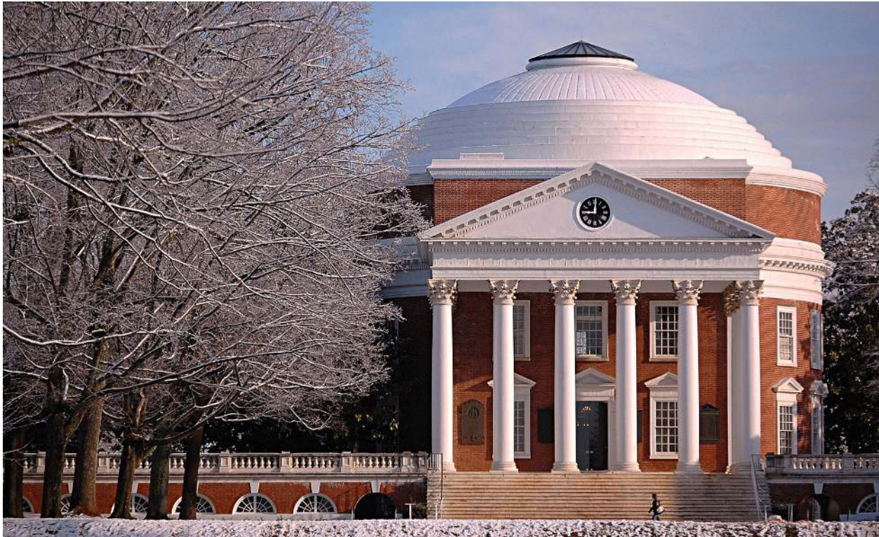
Thomas Jefferson's Rotunda at the University of Virginia on February 3, 2009