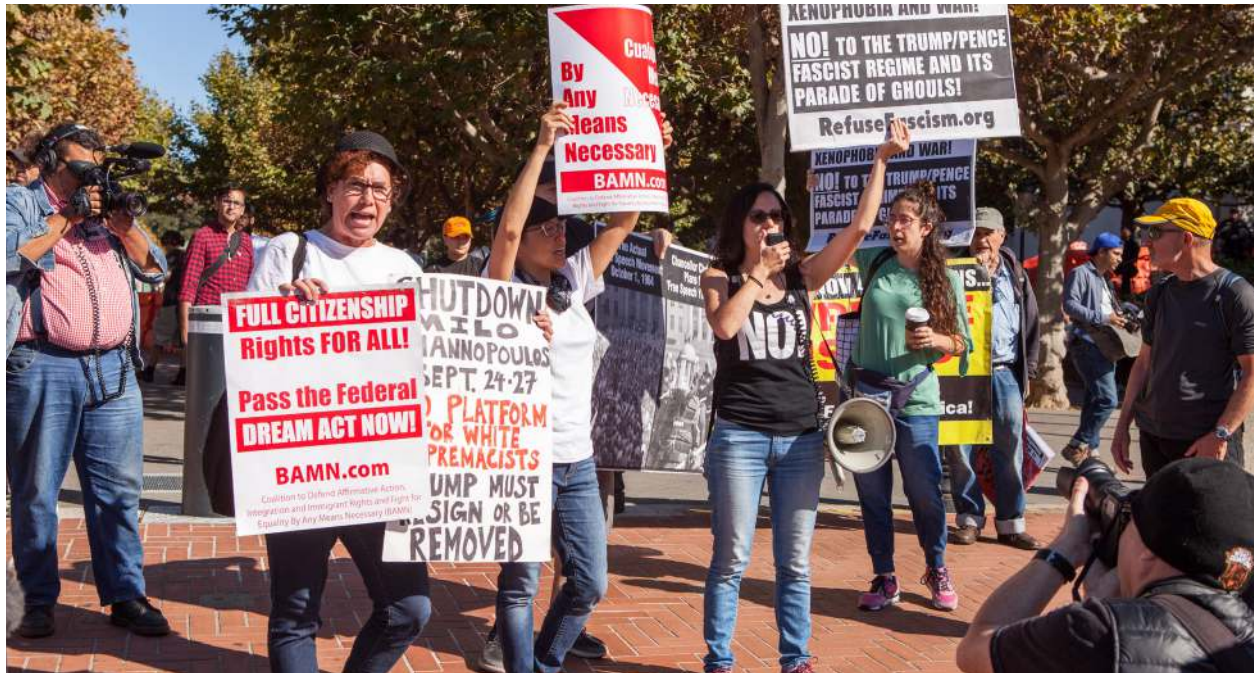
Activist groups, By Any Means Necessary (BAMN) and Refuse Fascism , gather on Sproul Plaza, UC Berkeley on September 24, 2017