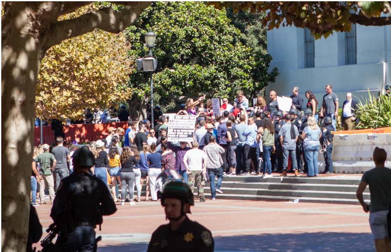
Milo Yiannopoulos (seen from a distance) greets supporters on the steps of Sproul Hall for 'Free Speech Week' at UC Berkeley, September 2017

revisiting the policies for allocating funding to student groups for events. 222