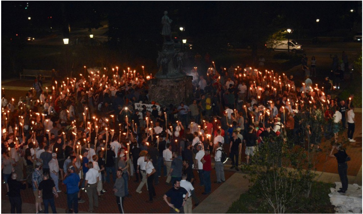
The white nationalist torchlit march in August 2017 came to a violent end at the Thomas Jefferson statue north of the Rotunda

Hiding behind the First Amendment in response to students' deeper demands to reckon with growing hate, intimidation, and racism risks alienating a rising generation of activists, leaders, and scholars from the fundamental tenets of free expression.