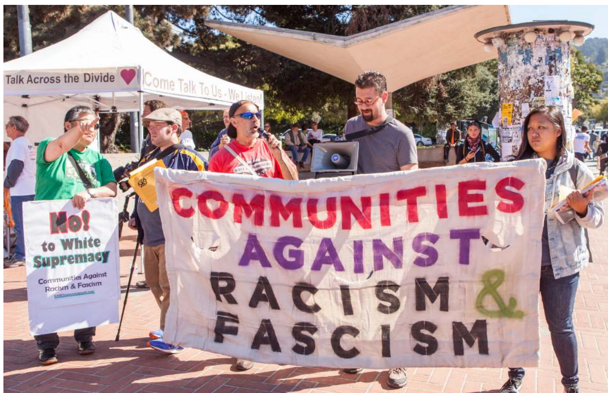
Protesters outside Sproul Plaza, UC Berkeley on September 24, 2017

Point USA and the student-run newspaper Minnesota Republic , were painted over entirely in white, and then with “Racists Not Welcome,” and “Can’t Paint Over Hate.” 15 When a student tried to tape signs over the Republican groups’ messages, an altercation broke out. 16 In response, a week later three student groups combined to splash the lone word “Censored” across nine panels. 17 A year later, the tug-of-war played out once again as Republican students wrote, “Make the U Great Again” and “The Proposed Pronoun Policy Mocks Real Social Issues”—a reference to the university’s new draft policy promoting the use of individuals’ preferred gender pronouns. These were quickly written over with large black letters spelling out “Queer Power.” 18