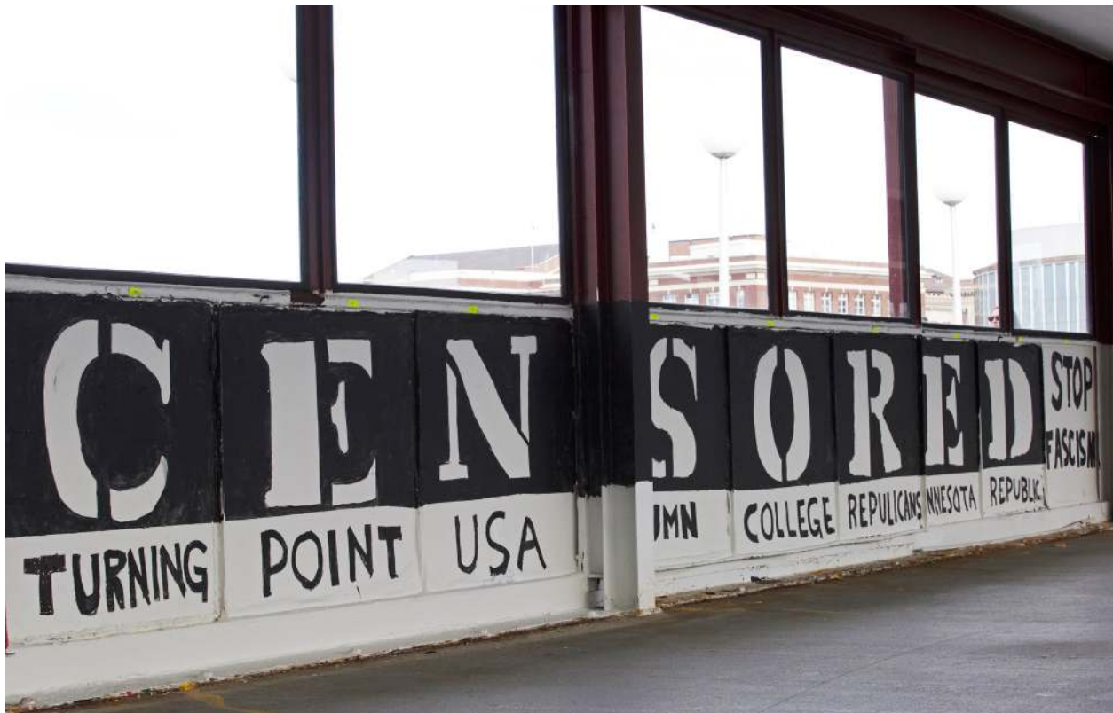
The murals for Turning Point USA, UMN College Republicans and the Minnesota Republic seen after they were repainted by the groups on the Washington Avenue Bridge in October, 2017

of symbols and statues, 162 they have become yet another flashpoint in a national contest over whose values will prevail, on campuses and in the broader society. Universities' approaches to these questions can loom large in determining whether students from diverse backgrounds feel a full sense of belonging and believe that they enjoy an equal opportunity to express themselves.