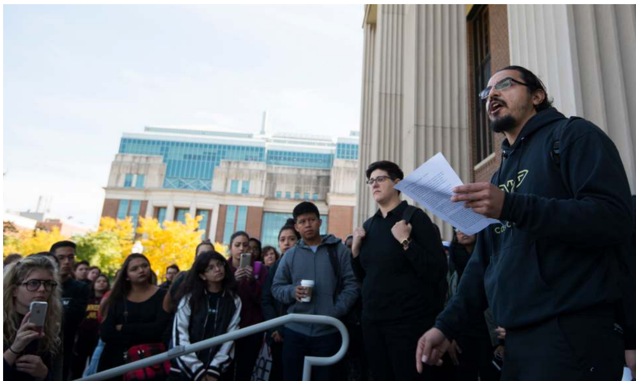
About 200 protesters gathered on October 6, 2016 at the University of Minnesota campus to protest “Build the Wall” panel