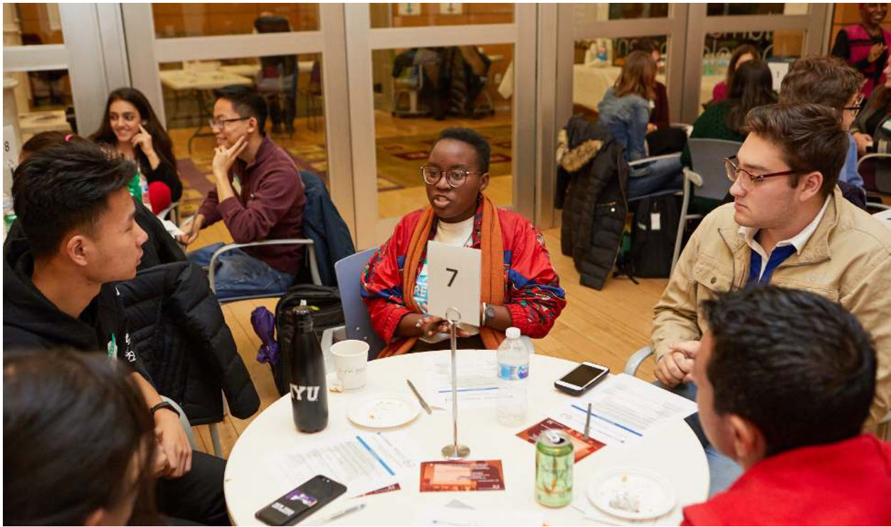
College students in dialogue. PEN America event at NYU in November 2018, co-sponsored with the Penn Project for Civic Engagement and NYU Steinhardt

free speech on campus should avoid the use of overbroad and vague definitions that have the potential curtail free speech or otherwise render legitimate topics of academic deliberation effectively off-limits.