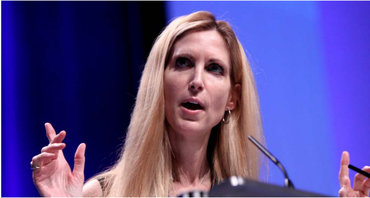
Conservative commentator and author Ann Coulter speaking at CPAC 2011 in Washington, D.C.