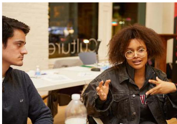
College students in dialogue. PEN America event at NYU in November 2018, co-sponsored with the Penn Project for Civic Engagement and NYU Steinhardt

In speaking with the administration on campus, we know that they’re trying, they are trying their hardest to allow the use of free expression of whatever views that people may want to share. But they also have a commitment