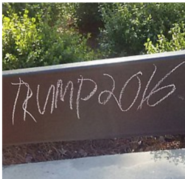
A chalking from the Emory University incident, which gave rise to the Chalking

It is not uncommon for universities to make the campus group that invites a speaker pay for security costs, with each group receiving an annual budget. In 2017 at Cornell, a mostly private Ivy League university, conservative campus groups argued that such a practice places a disproportionate burden on them: Because their chosen speakers tend to hold